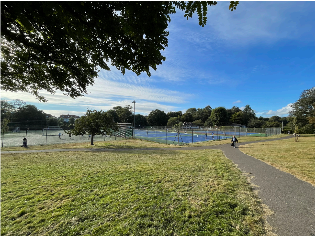
Hove Park Tennis Courts looking north west. 5 a side pitches on the left.

The application site, Hove Park Tennis Alliance, consists of 7 tennis courts covering 3420sqm, the application seeks approval for flood lights to illuminate courts 1-5 covering 2390sqm. The tennis courts are located in the southern part of the park adjoining the 5 a side football pitches. The football pitches already benefit from floodlighting, half of their posts are within the tennis courts boundary.