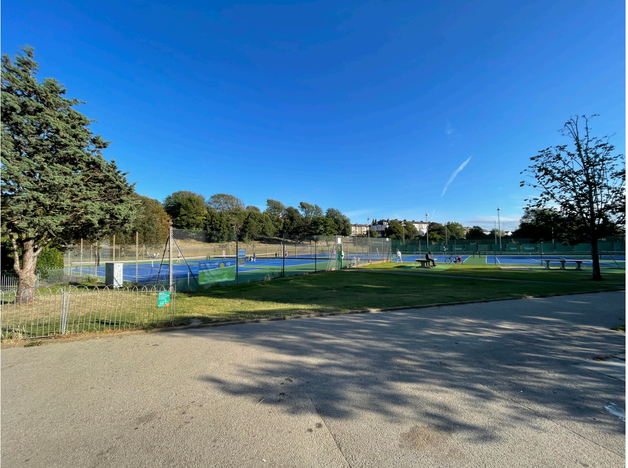
Hove Park Tennis Courts looking south east.